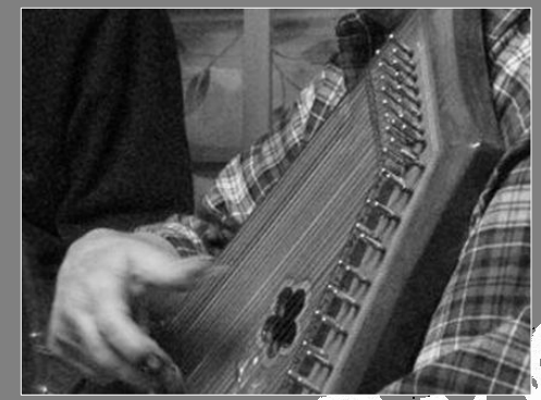
Strumming & Singing